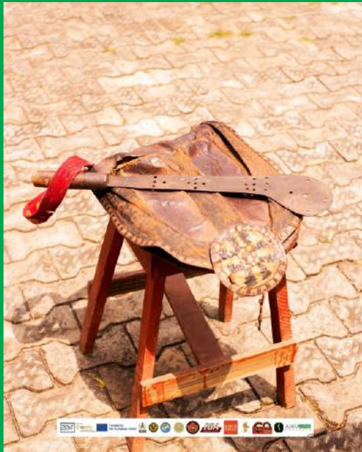
AGADA ATI APO LABA: THIS IS A SYMBOL OF CHIEFTAINCY. EVERY CHIEF IS ENTITLED TO IT