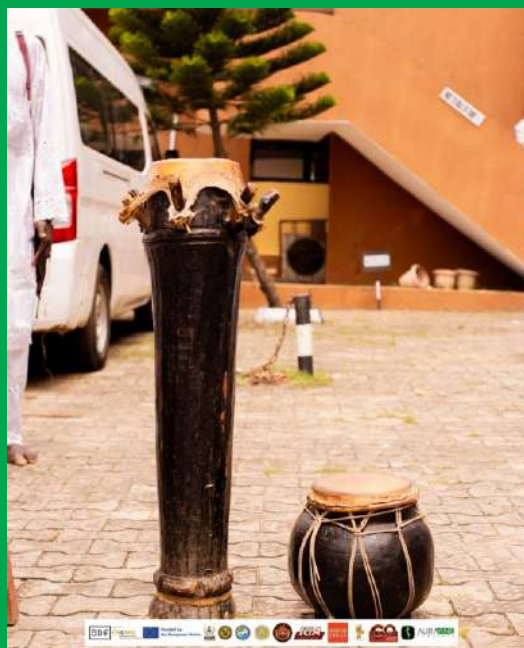
ARAN ATI APELESI: DRUMS USED BY AGEMO AND ORISA NLA