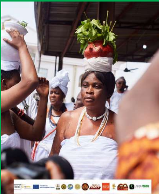
OBA LU AIYE WORSHIPPERS