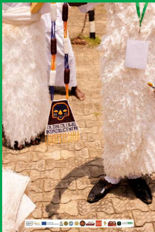
IKO ORUN: A SYMBOL OF IDENTITY