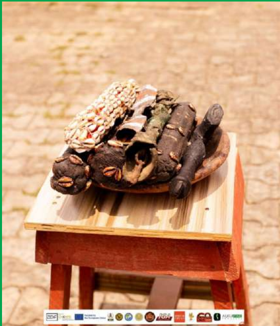
IWO OBA LU AIYE: SYMBOL OF TITLE FOR OBA LU AIYE CHIEFS

THIS IS ONE OF THE MOST RECOGNIZED DEITIES IN IKORODU. IT IS USED TO PRAY AND ENTERTAIN PEOPLE, IT CAN ONLY BE SEEN ON SPECIAL OCCASIONS AS WELL.