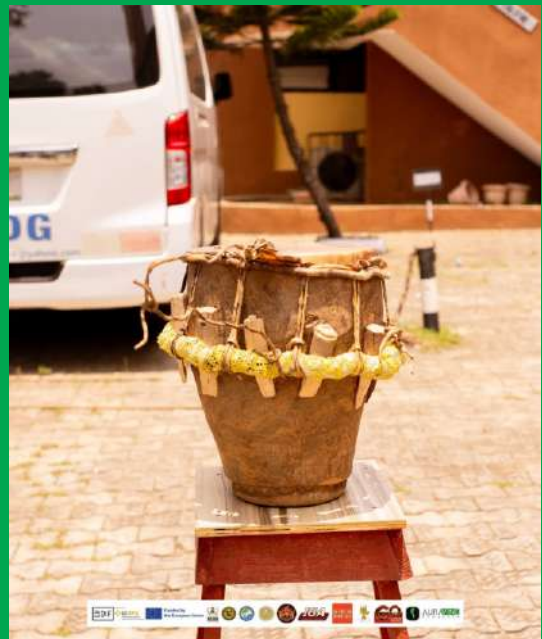
ILU ILALE: USED BY ASA AND ILERE ORO GROUP