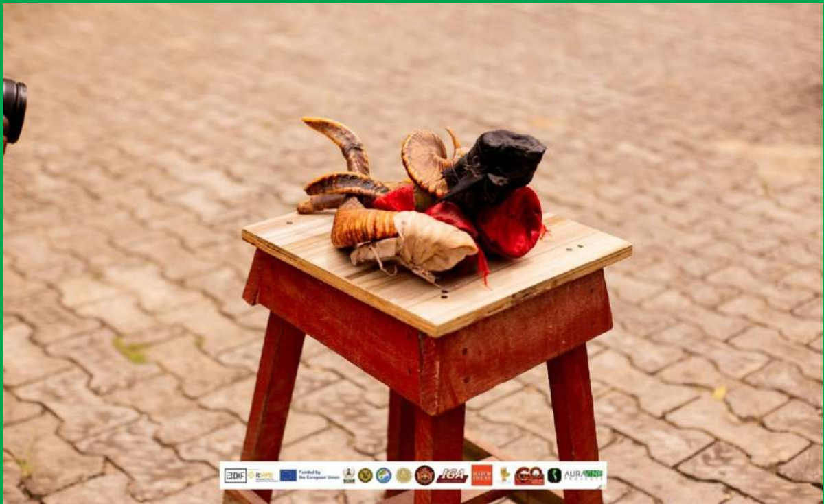
OLUGBOHUN: IT IS USED FOR PRAYERS