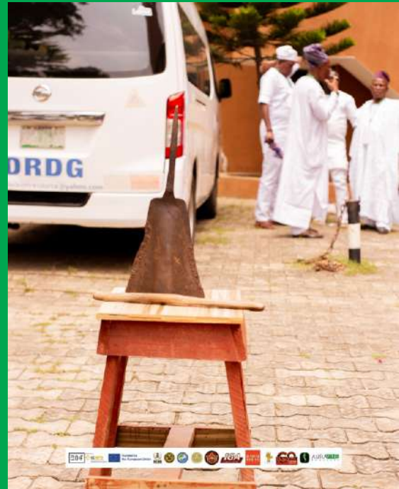
AGOGO ASA (GONG & STICK)