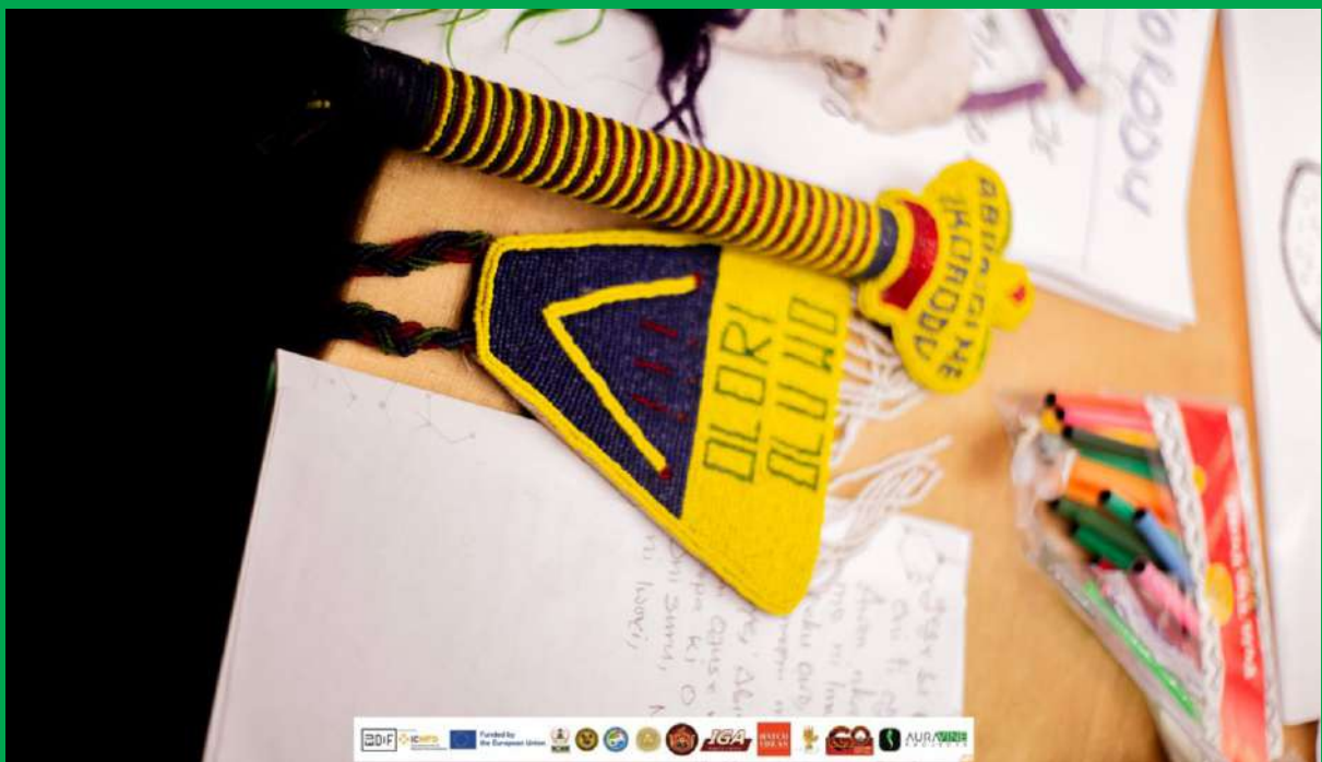
IREKE ATI IKORUN ILEWO OTUNBA: IT IS A SYMBOL OF TITLE FOR THE IYALODE