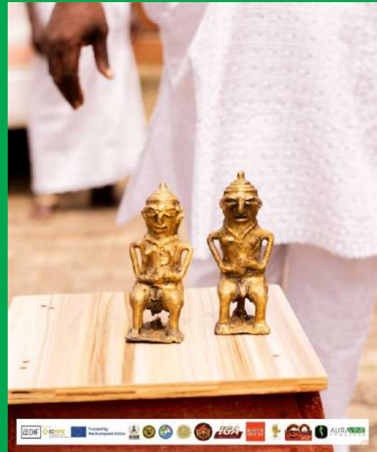
EDAN: ALL ONISESE USE THE EDUN TO PRAY