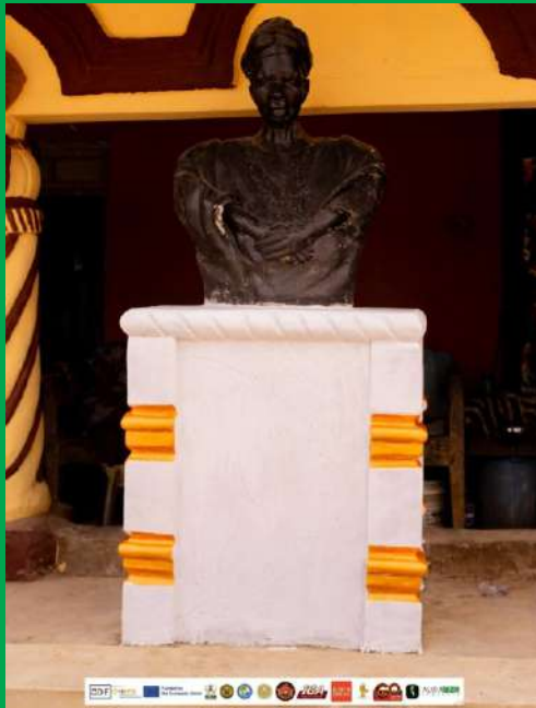
ERE BALOGUN: IGA BALOGUN IKORODU