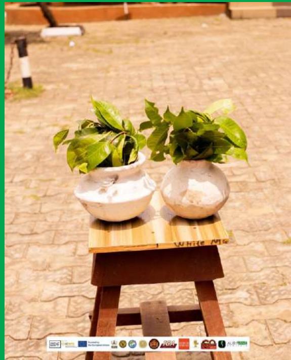
OTUN OSA NLA: IT IS USED BY OLORISA OSUN