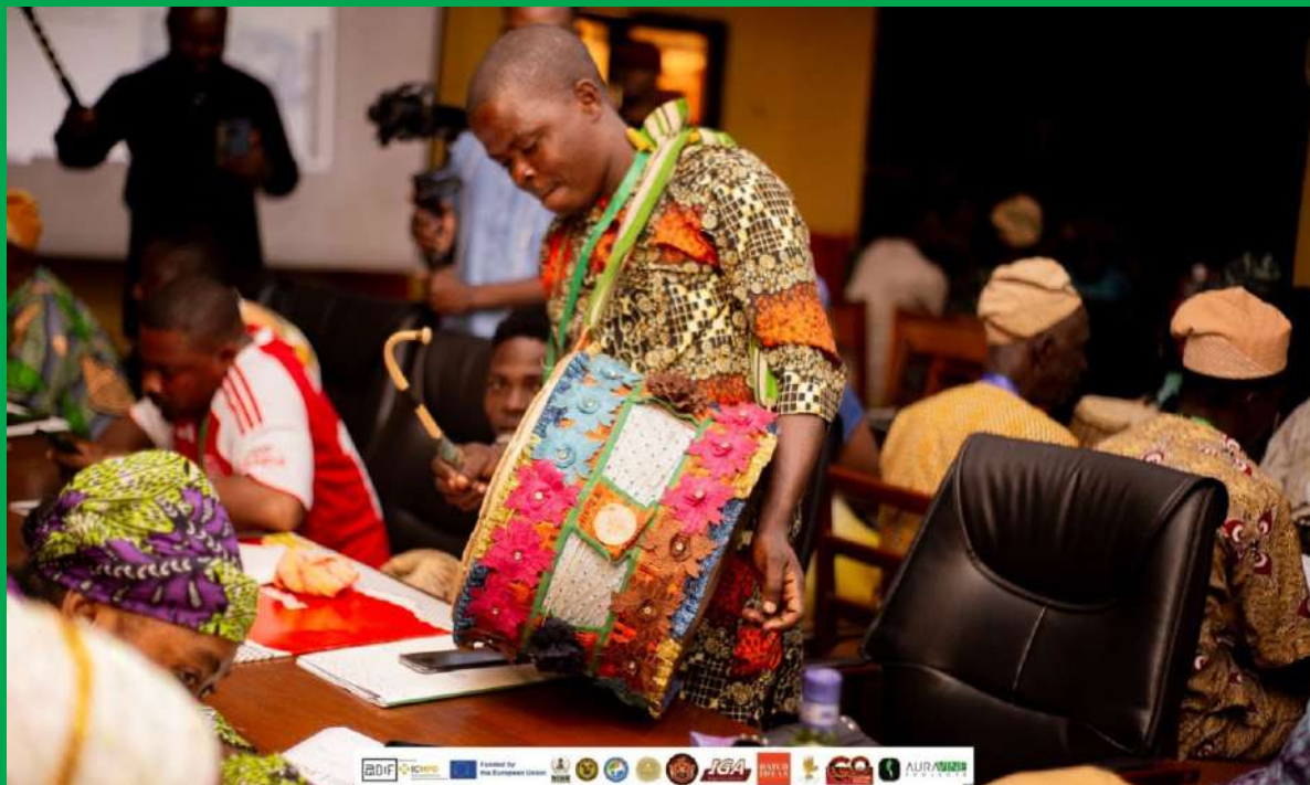
BEMBEM EGUN: USED DURING THE EGUNOKO FESTIVAL