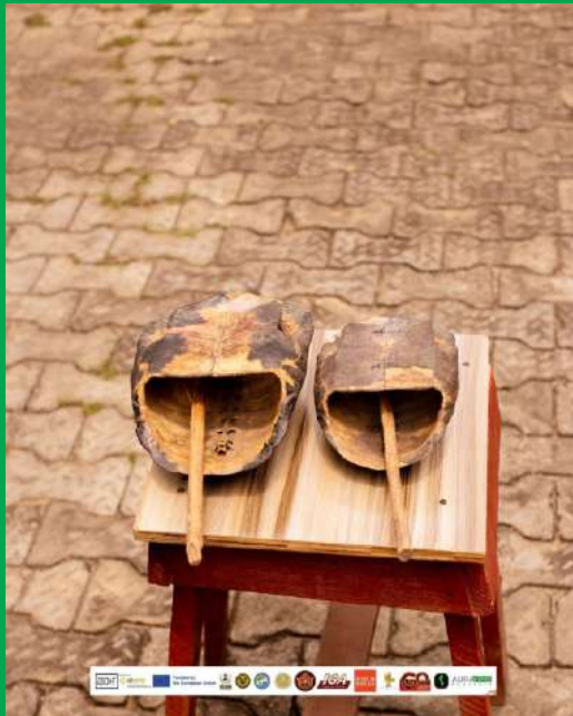
KEKEKU: THIS IS USED WHEN THE KING WANTS TO CELEBRATE ODUN OSU