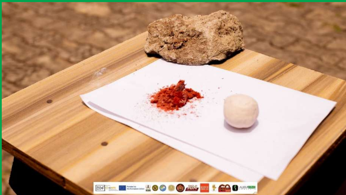
OSUN ATI EFUN: IT IS USED DURING CORONATION