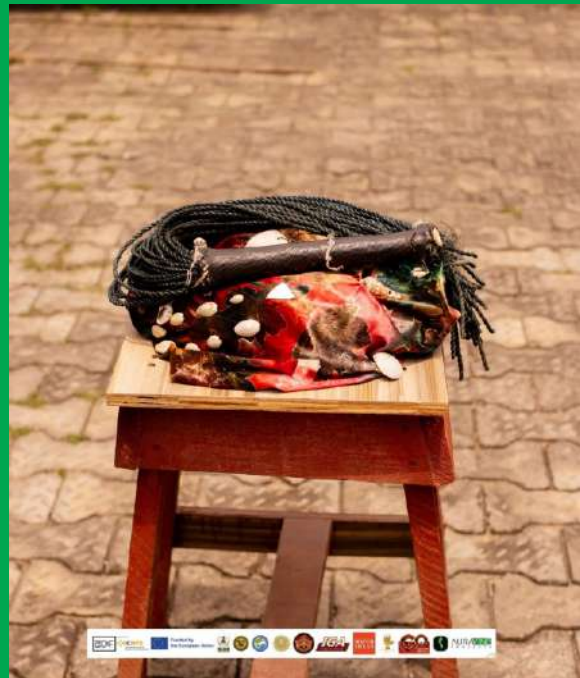
AJUBA RA OBA LU AIYE: THIS IS HUNG ON THE SHOULDERS OF THE OBA LU AIYE CHIEFS DURING THEIR FESTIVALS