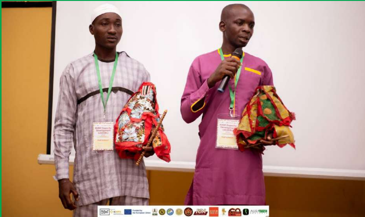
AAGO EGUN: AGO EGUN IS VERY SPIRITUAL. IT CAN BE USED TO OFFER PRAYERS DURING THE FESTIVAL. IT CARRIES SUBSTANCES THAT IS USED TO CURE ILLNESSES.