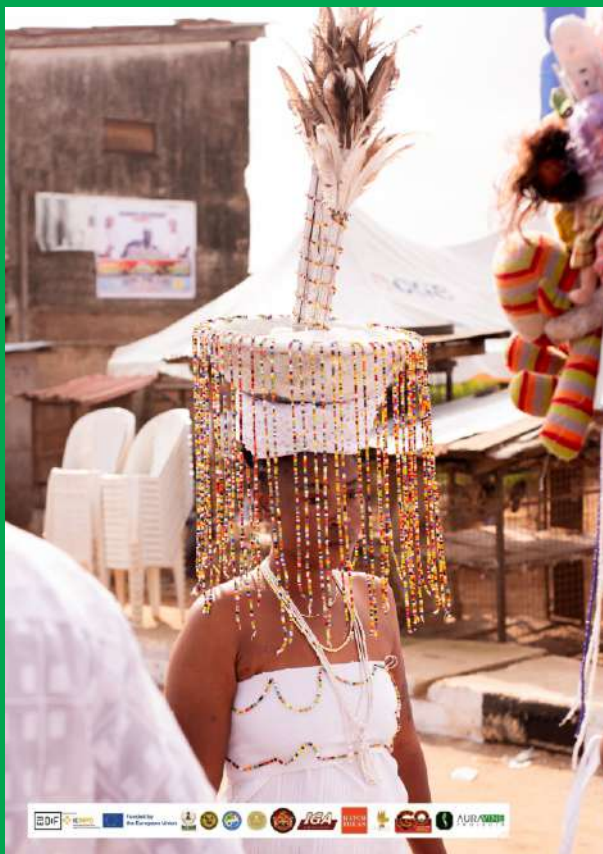
OSA AJE: FOR PRAYING FOR PROSPERITY