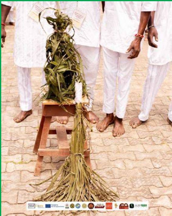
TURUKU: IT IS USED TO ASK FOR A CHILD WHEN THERE IS A DELAY IN CONCEIVING