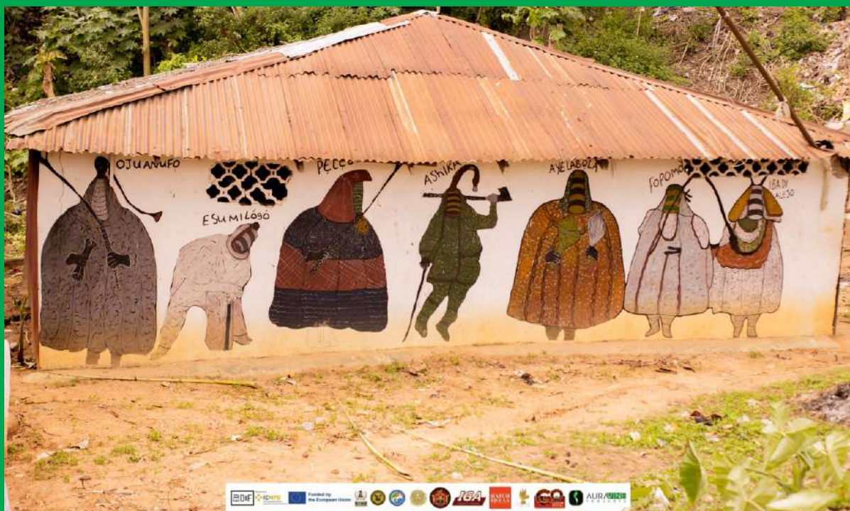
IGALE EGUN: IT IS THE SHRINE OF THE MASQUERADE