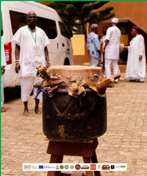
GBEDU OBA: THIS IS ONLY USED WHEN THE KING WANTS TO ANNOUNCE A PARTICULAR FESTIVAL