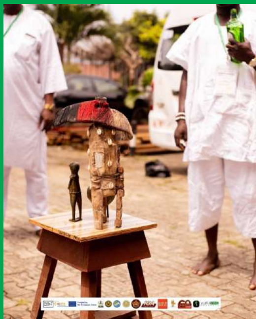
A POWERFUL ORISA USED BY HERBALISTS