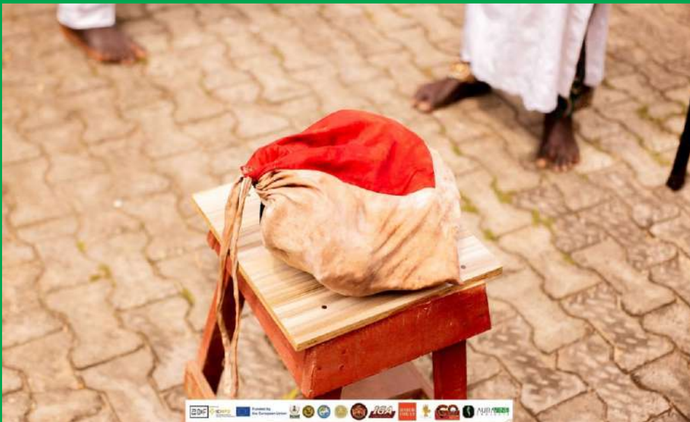
ASUN: IT IS JUST LIKE THE APO LABA. IT IS USED TO CARRY ELDERS' ARTEFACTS