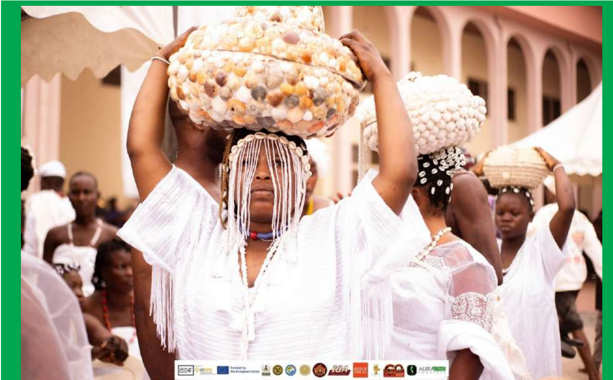
AJE OSUN: AJE OSUN IS USED TO PRAY FOR WEALTH AND FOR SUCCESS IN LIFE