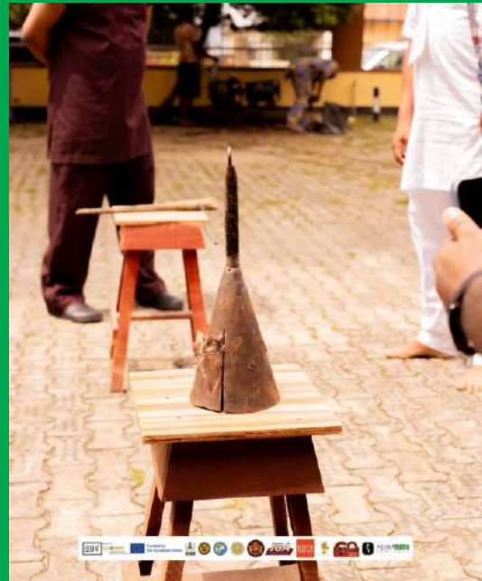
AJA: AJA IS USED FOR COMMUNICATING WITH THE GODS, IT IS AN INSTRUMENT FOR ASE