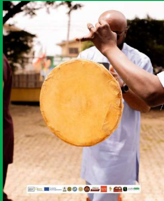
ILU SAKARA OR BEMBE: IT IS AN INSTRUMENT MOSTLY USED BY THE ASA