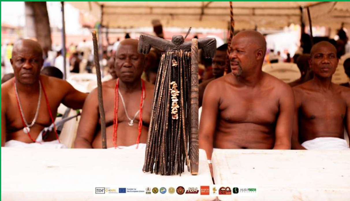
KEREKERE AWOPA: IT IS A STRONG SPIRITUAL ARTEFACT AND A FORM OF IDENTITY FOR THE AWOPA WORSHIPPERS