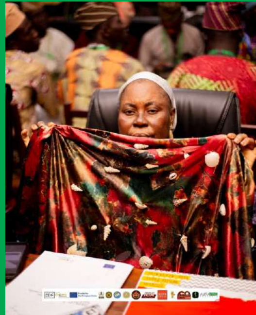
ASO OBA OLU AIYE: USED TO COVER THE BODY OF CUSTODIANS DURING FESTIVALS OR IMPORTANT OUTINGS